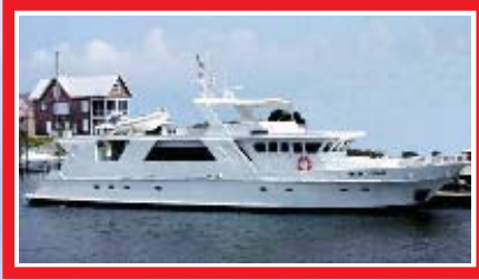
CHART A COURSE FOR SUCCESS

For Centuries the ocean has fueled our sense of adventure, and taught us valuable lessons about survival and our connection to the environment. That premise, learning about ourselves and our environment, is what Ocean Science International, Inc. is all about.